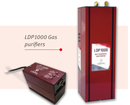
LDP1000 Gas purifiers

A range gas purifiers, gas dilution systems and stream selectors to optimize and retain gas purity at every stage of sampling to ensure the best performance for trace impurity measurements at ppb levels.