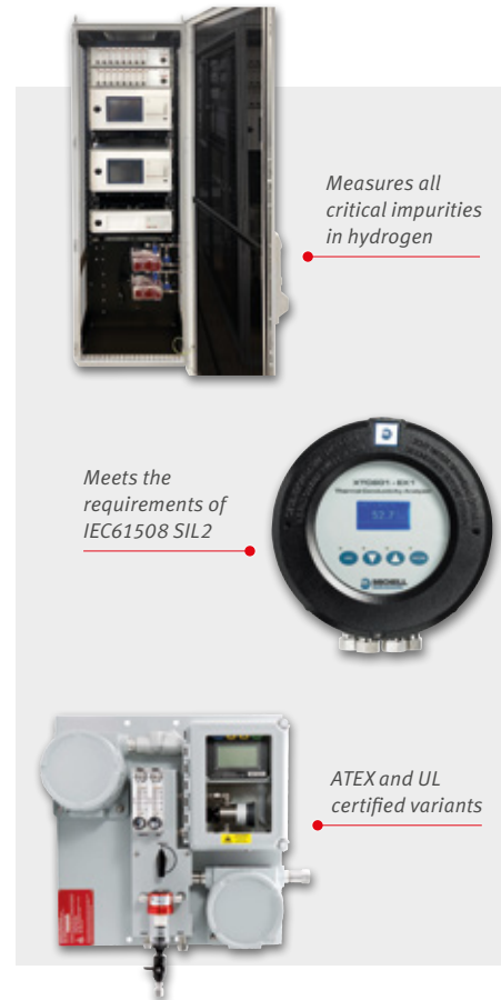
Measures all critical impurities in hydrogen