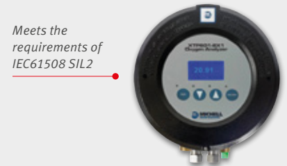
Meets the requirements of IEC61508 SIL2