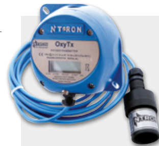
Remote oxygen sensor for easy installation and maintenance