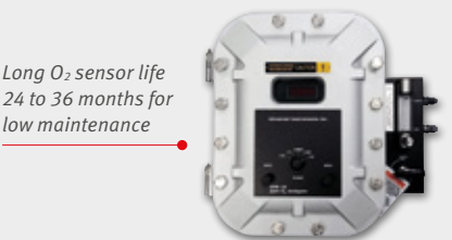
Long O 2 sensor life 24 to 36 months for low maintenance