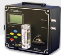
Up to 30 days battery life