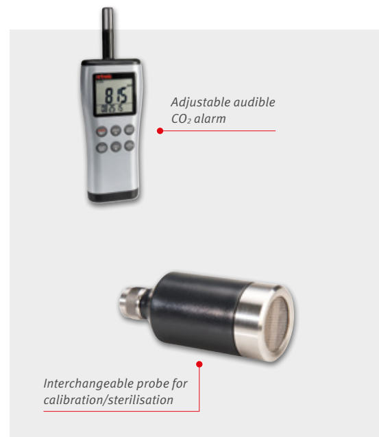
Adjustable audible CO 2 alarm