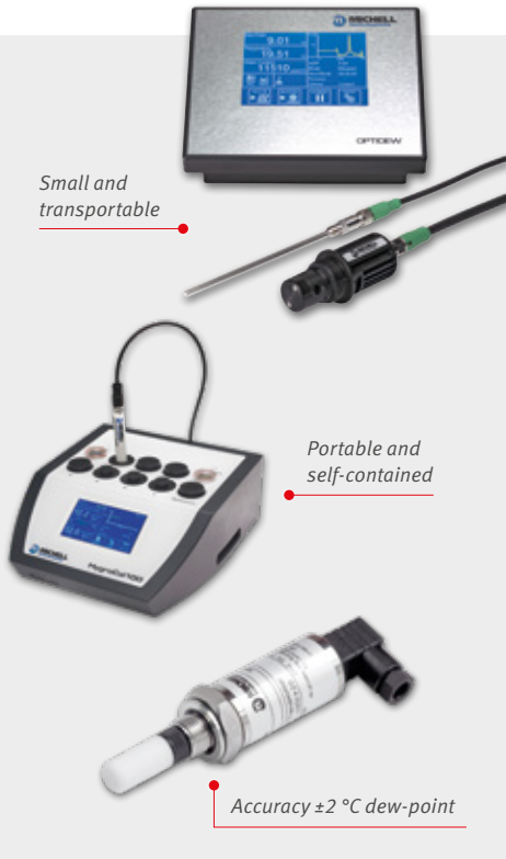
Small and transportable

Low dew-point and trace moisture measurement plays a key role in monitoring industrial dryers for efficiency and to ensure product quality.