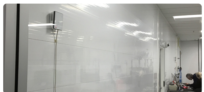
Gateway transferring the following data: relative humidity, temperature, differential pressure, particle and gas detection.