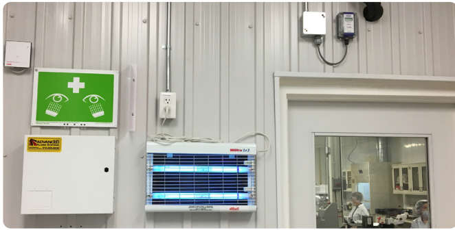
Differential Pressure Monitoring of the Labs.