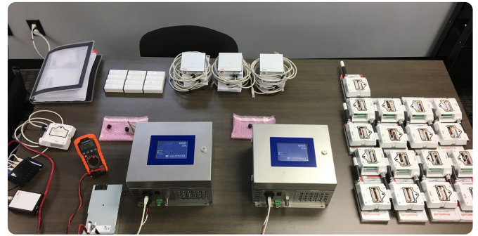
Rotronic and third party products ready for installation and integration into the RMS continuous monitoring system at Canopy Growth.