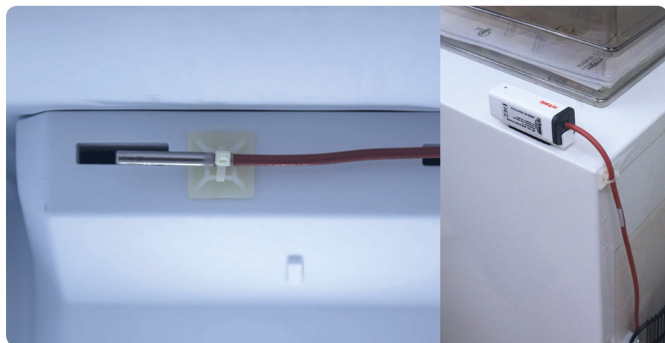
For monitoring of the insulated refrigerators, a cable probe connected to the wireless logger is routed into the interior of the refrigerator.

The Rotronic team picked up the needs of the Rosengarten Apotheke and, in consultation with the customer, defined and proposed the monitoring system required to meet the legal requirements. After approval, the required hardware was calibrated, installed and configured by Rotronic on site (naming of loggers, setting of alarm limits, reports with pharmacy logo, mail connection, etc.).