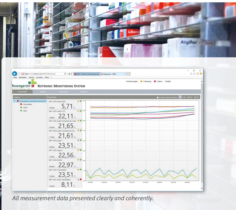
All measurement data presented clearly and coherently.