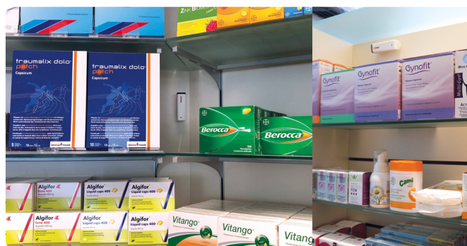
RMS Wireless Mini Loggers placed in the salesroom monitor discreetly and reliably.

As soon as a measured value falls below or exceeds the defined limit, the system triggers an alarm. An e-mail is sent to the proprietor and the responsible pharmacists. Four alarm levels can be selected in the RMS, depending on the risk. “Reminders” for non-urgent events, “Warnings” or “Alarms” for measured values outside set limits and “Errors” for possible hardware errors. Alerted events must be acknowledged; causes and measures can also be entered and stored in a text field.